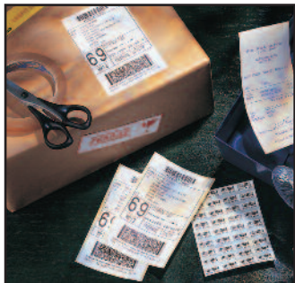
Efficient and Convenient

The TSP828 packs so much value and performance into a desktop label printer... You'll wonder why anyone would choose another.