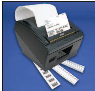
Batch Print or Auto Peel