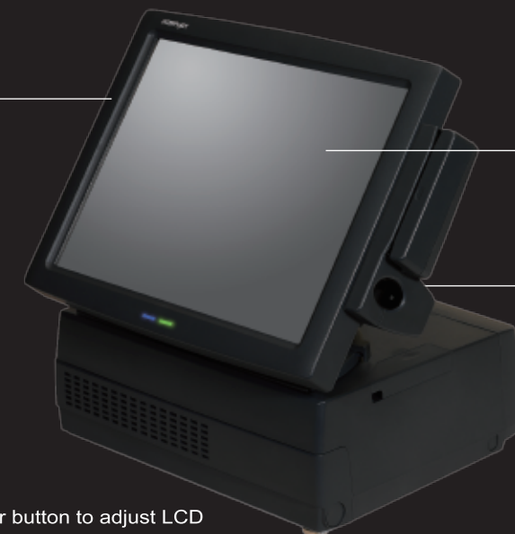
Resistive touch screen (Optional) : 12" LCD