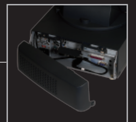
Rear cable cover for safety and neat outlook