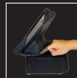
Gear button to adjust LCD swivel angle from 0° to 16° horizontally