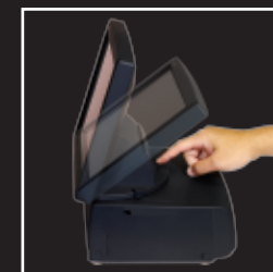
Gear button to adjust LCD tilt angle from 40° to 75° vertically