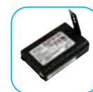
Standard battery excl. battery door