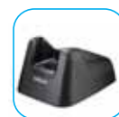
Cradle single slot USB