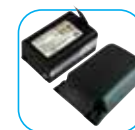
Double battery incl. battery door