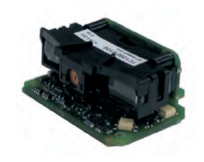
TC1200 SCAN ENGINE MODEL